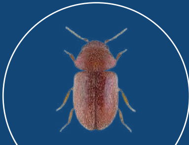
Cigarette Beetles (CB)