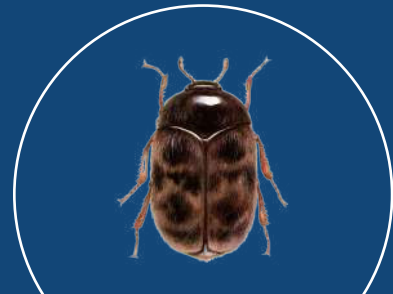
Khapra and Warehouse Beetles (KB/WB)